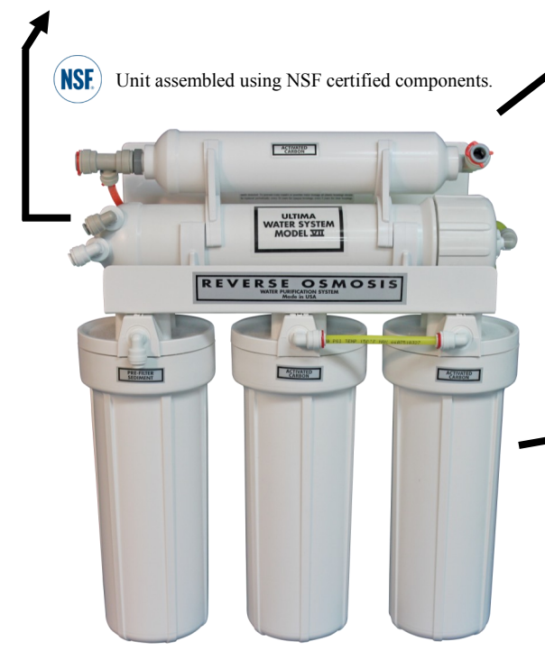
Units also available in black.

The Pentair Membrane boast a performance second to none of the standard reverse osmosis elements. It does all this and delivers awesome quality water. Available in multiple sizes from 24gpd to 100gpd..