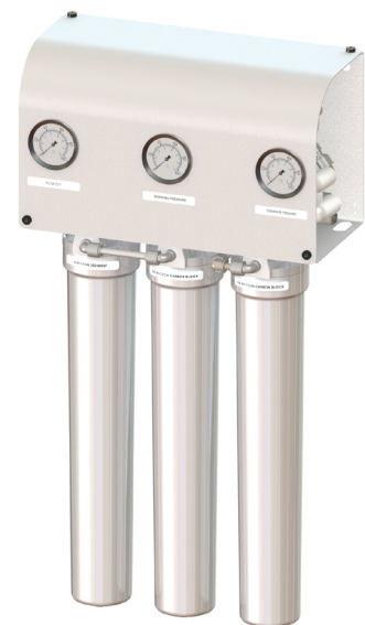
AXEON LP-700 Reverse Osmosis System with Optional Cover with Pressure Gauges