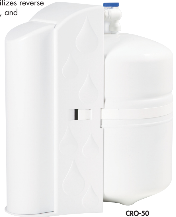
CRO-50 Reverse Osmosis System