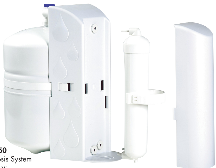
CRO-50 Reverse Osmosis System Exploded View

The AXEON CRO-Series Reverse Osmosis System incorporates 3/8" tubing for faucet and tank connections. This larger diameter tubing ensures a faster flow rate of approximately 30% from the faucet.