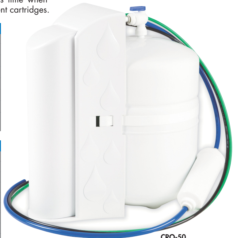
CRO-50 Complete system with tubing and in-line postfilter