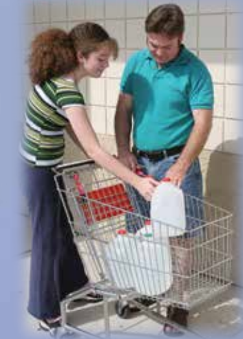
Pure & healthy

Instead of wasting time and money on buying and carrying safe drinking water, invest in your own pure water machine. The crisp taste of pure water from your MILLENNIUM drinking water system is very economical and costs pennies per gallon.